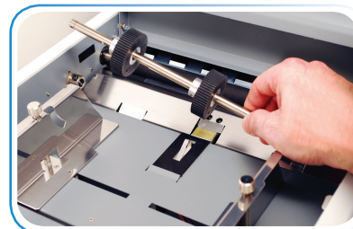
Removable Feed Wheels

Batch Counter: Programmable to process pre-set number of sheets and stops