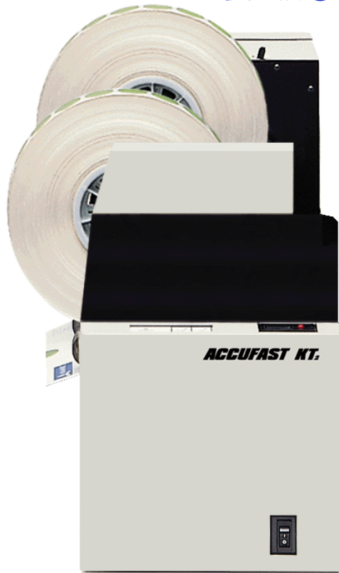
The ACCUFAST KT2 Mail Tabber

The ACCUFAST KT2 is the professional mailer's choice in a table top tabber. Speed, flexibility, reliability and simplicity are all featured in the KT2. It applies either one or two tabs per piece by using one or both of its self centering tabbing heads. The KT2 can be set up to run different types of tabs in different heads if necessary. Not only do you get performance, you get support from a local dealer or the KT2's factory in New York.